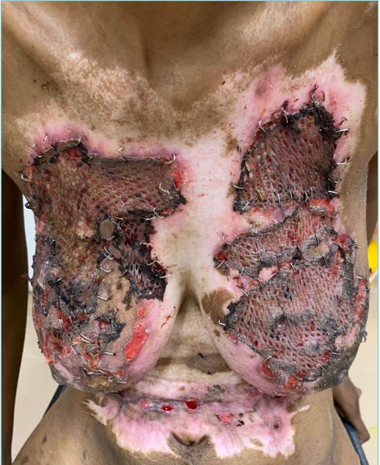
Figure 1 The patient with severe burn wounds post skin graft